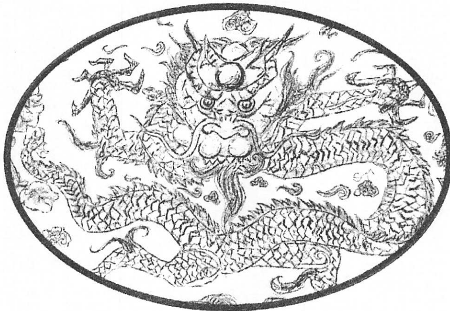
Dragon by Diya Wilson

Afternoon Assembly @ 1:15 in Gym Evening Festival @ 6:30 in Cafeteria January 15 th